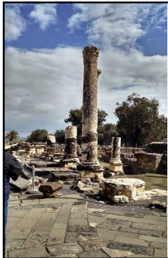
Column at Beth-shean